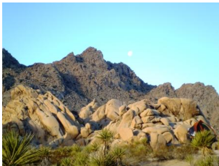
Beautiful Morning at Joshua Tree