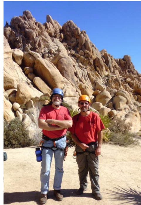
Caution: Scouts having fun.

In Russia they have Optimists - You can tell them as they always are saying “Of course things can get worse”!