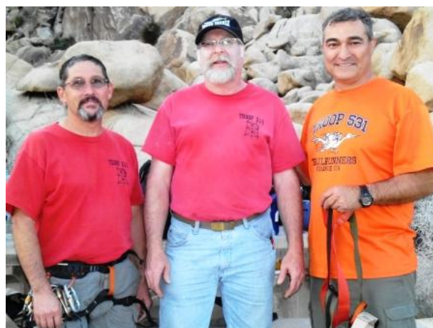
Training included helping Troop 531 get their Climbing Merit Badge.